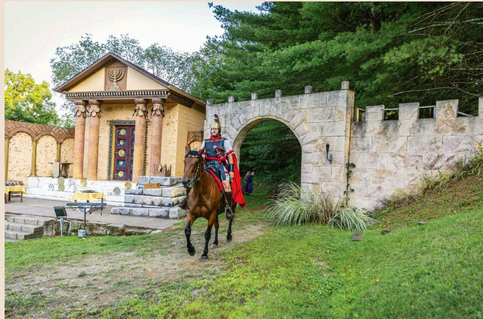
Living Word Outdoor Drama

Explore a blend of history, culture and natural beauty and create lasting memories of Cambridge/Guernsey County.