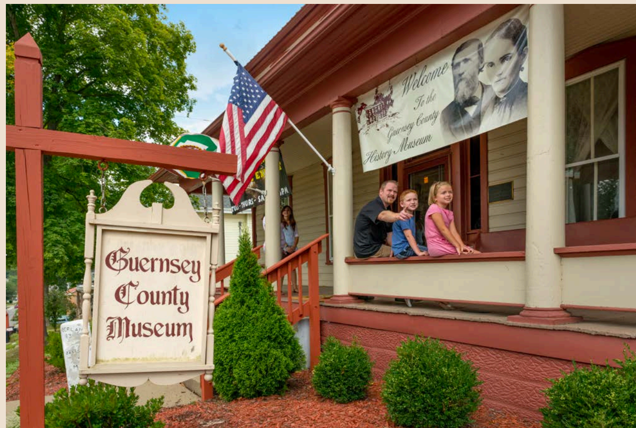
Guernsey County History Museum