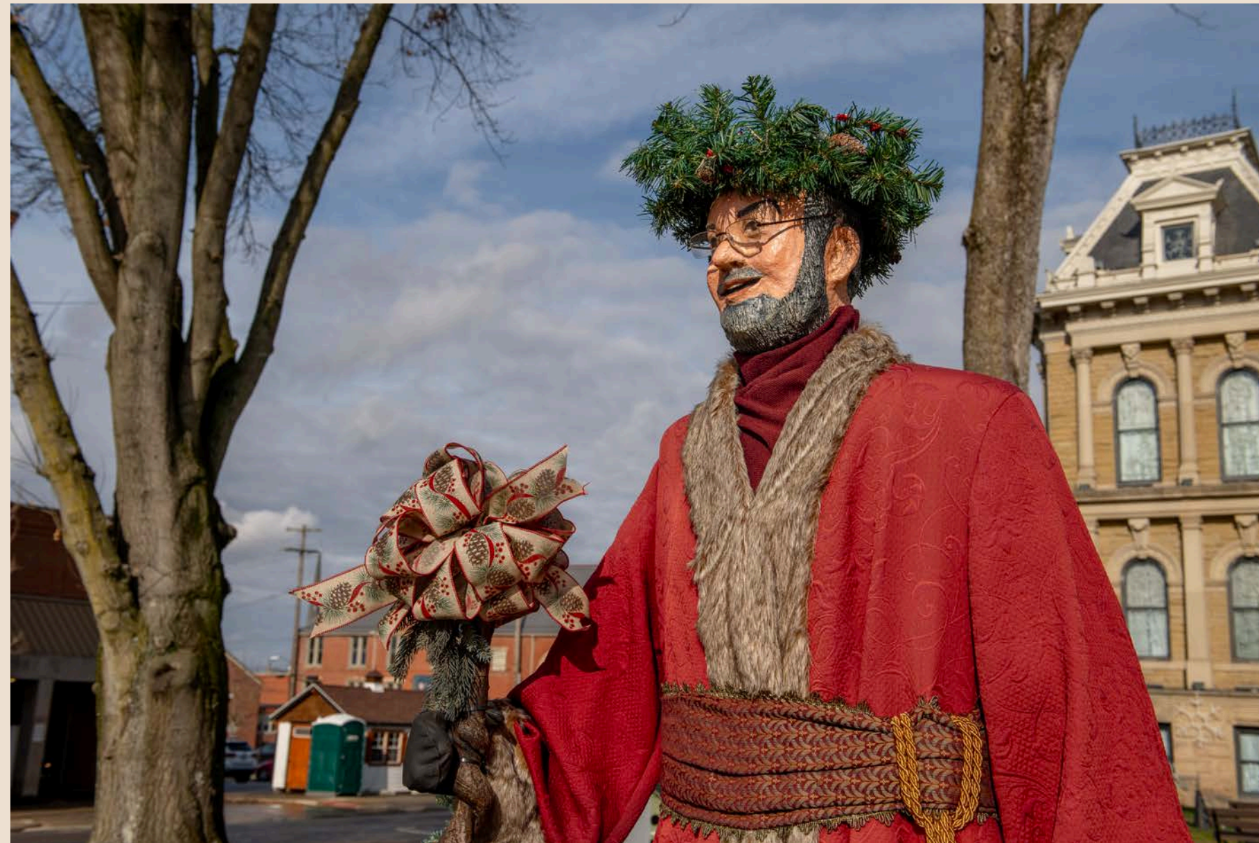
Dickens Victorian Village