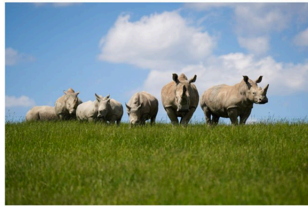
The Wilds

Lodging. You will find the perfect place to stay while you visit us in Cambridge/Guernsey County.