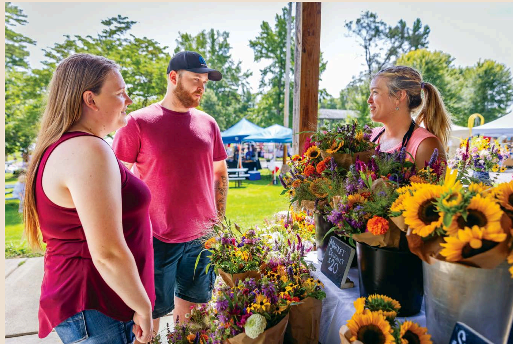
Salt Fork Arts & Crafts Festival

Experience the charm of Cambridge/Guernsey County, where small-town warmth meets exciting events. Our community comes alive throughout the year with a variety of signature events that showcase our rich history, vibrant culture and natural beauty.