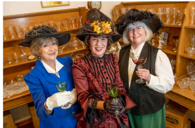
National Museum of Cambridge Glass