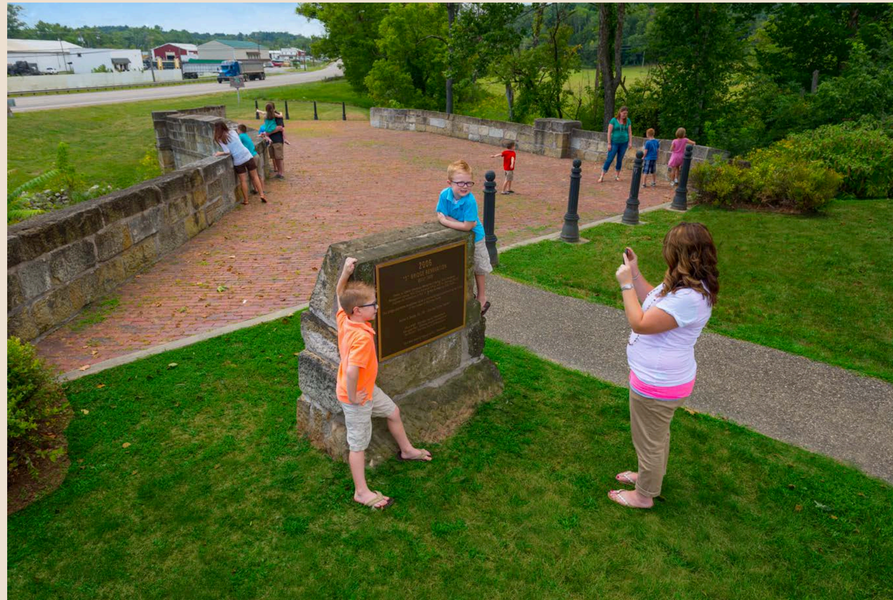
Peters Creek S-Bridge