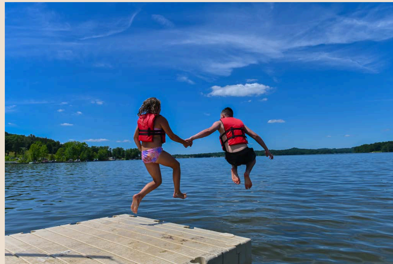
Seneca Lake Park