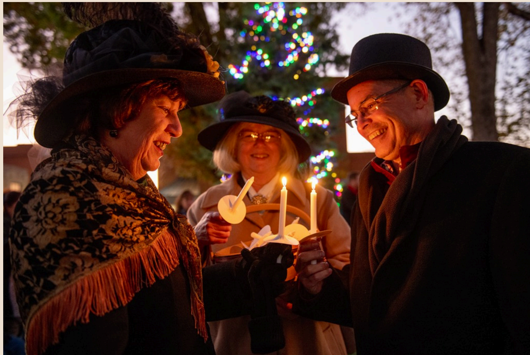
Dickens Victorian Village

Here are some key aspects that set this region apart: