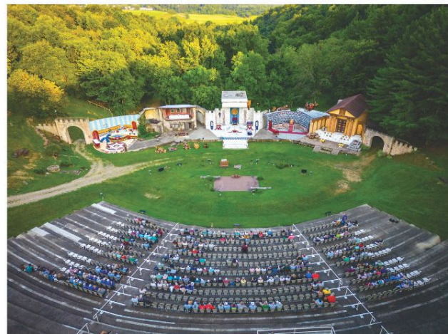
Living Word Outdoor Drama