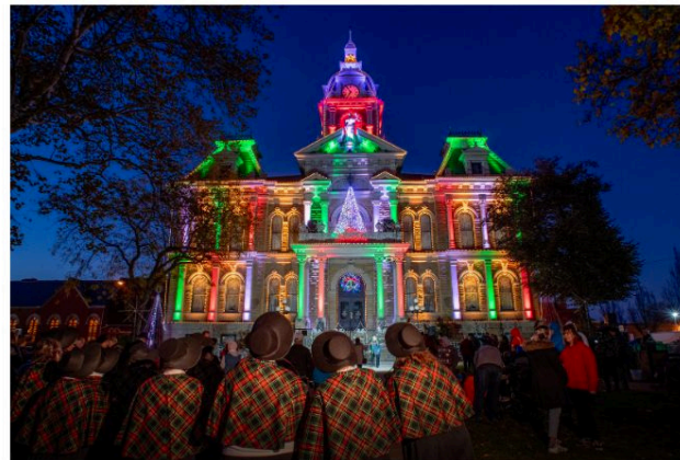
Guernsey County Courthouse Light Show

About Us. Long before it was hip to take a trip on Route 66, the National Road, An All American Scenic Byway, served as America's first highway to adventure. Positioned along America's early frontier, Cambridge/Guernsey County in Southeast Ohio has been welcoming travelers to the area for nearly 200 years. Your groups will enjoy a piece of idyllic Americana in which Main Street USA is the heart of our communities and life moves at a more relaxed pace.