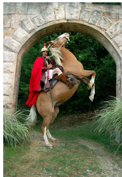
Living Word Outdoor Drama Celebrating 50 years

About Us. Long before it was hip to take a trip on Route 66, the National Road, An All American Scenic Byway, served as America's first highway to adventure. Positioned along America's early frontier, Cambridge/Guernsey County in Southeast Ohio has been welcoming travelers to the area for nearly 200 years. Your groups will enjoy a piece of idyllic Americana in which Main Street USA is the heart of our communities and life moves at a more relaxed pace.