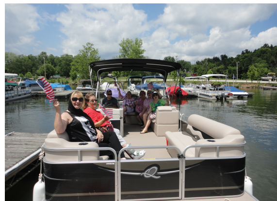
Seneca Lake Pontoon Boat Ride