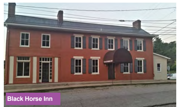
Black Horse Inn