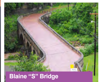
Blaine "S" Bridge