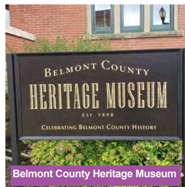
Belmont County Heritage Museum