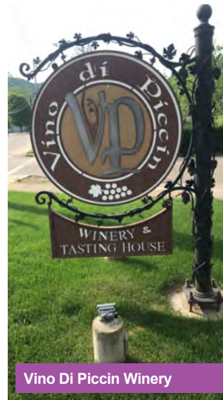
Vino Di Piccin Winery

This former church offers a quaint gathering place located in historic Morristown. Your group can enjoy tea and dessert here from The Pike 40.