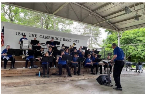
Cambridge City Band

Between June and September, the Cambridge City Band, the oldest continuously playing community band in the state of Ohio, originating in 1841, thrills its audiences with a free evening of music in the Cambridge City Park. Most concerts are every other Thursday at 7:30 p.m. or on holidays. Each year the band has a theme. A narrator shares information regarding each piece performed and there are vocalists and various entertainment surprises that include audience participation. Be sure to add this option when booking.