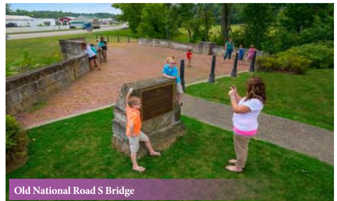
Old National Road S Bridge

The National Road offers adventure seekers today a great road trip just as it did two centuries ago. More than 30 key attractions and points of interest, specific to the history of the road, are located throughout the county. From the famous "S" bridges to stagecoach stops and tollgates, the route is lined with picture perfect sites. For a free driving tour brochure, contact the Cambridge/Guernsey County VCB.